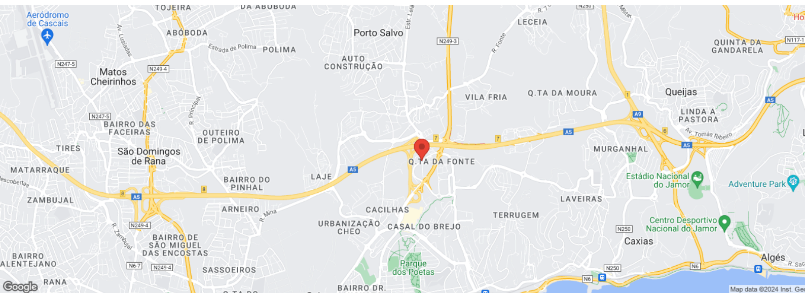
QUINTA DA FONTE Q61 - Lease